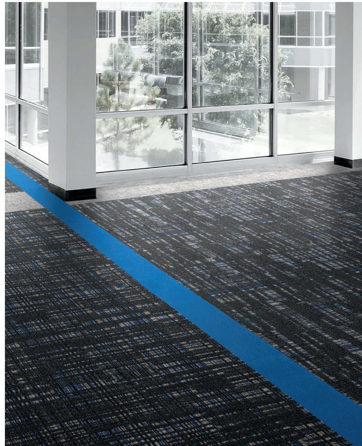
SUITABLE™ 4UVT4, RELEVANT 411461, ELITEFLEX™ 6 FT CUSHION (IN TWO DIRECTIONS) MULTIPLAY™ 4MYT4, AVATAR 401379, 18 IN X 36 IN COHORT™ 8OHT5, SUPPLY + DEMAND 400350, 9 IN X 36 IN