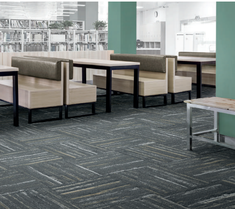
TROUBADOUR™ 4TOT5, PURE PASSAGE 400331, 24 IN X 24 IN - QUARTER TURN

ASHA recommends that background noise and reverberation be considered when designing spaces for learning. Simple ways to make a classroom quieter include adding soft materials such as carpet or rugs on the floor, and felt or cork on the walls, to absorb sound and dampen noise.