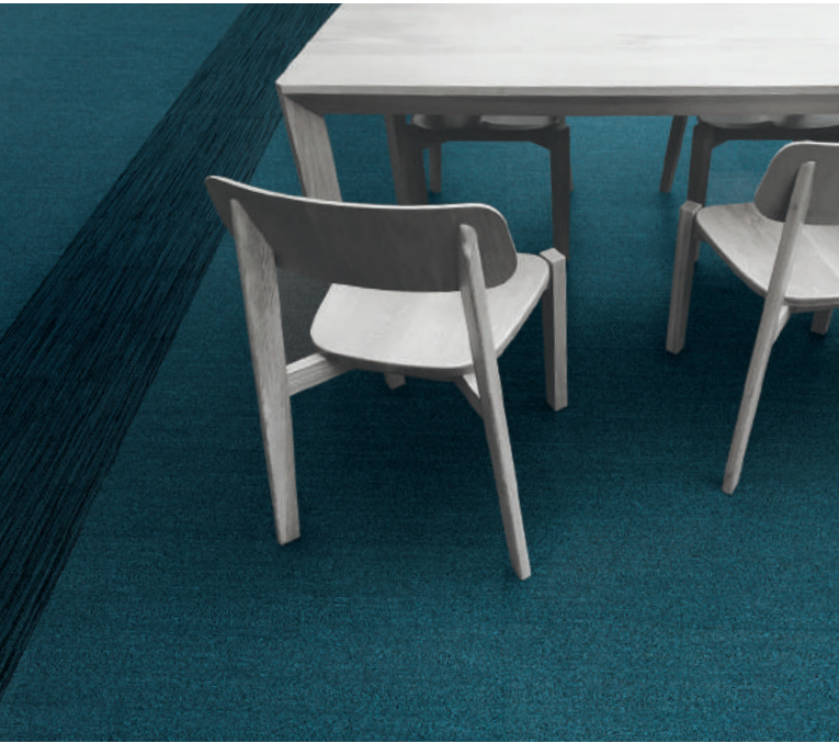
COLOR CORE™ 4EOT0, SWIM 402552, 18 IN X 36 IN - BRICK SHAPESHIFTER™ 4SET4, PARTICLE 400034, 18 IN X 36 IN

FINISH. Bentley's FULFILL™ carpet reclamation program guarantees 100% landfill diversion. Our national network facilitates the best reclamation options available, the most cost-effective service, and a stress-free experience.