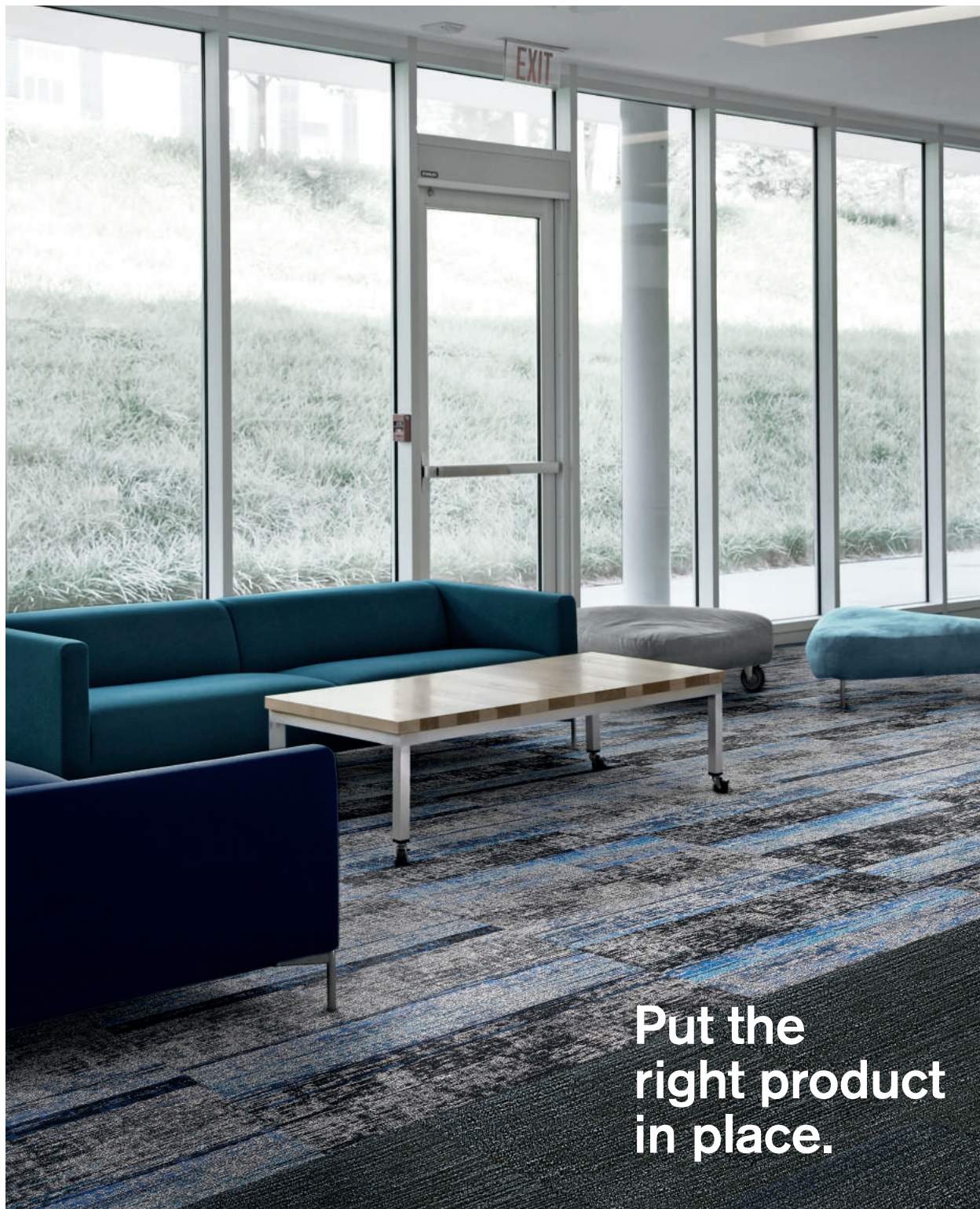
DRUMLINE™ 4DMT4, FIGHT SONG 404322, 18 IN X 36 IN - BRICK ROUGH IDEA SHEAR™ 8RN24, PLOT 800118, 24 IN X 24 IN - MONOLITHIC