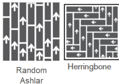
Plank Installation Methods