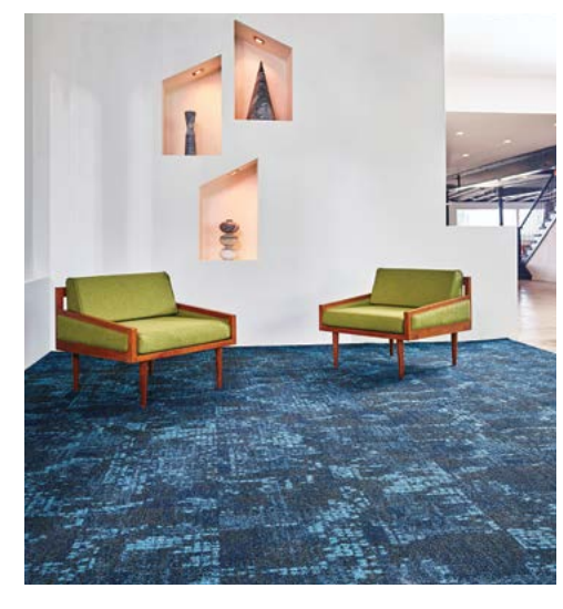
[COVER PHOTO] MISFIT 8FW24, DISTINCT 801793, 18 IN X 36 IN - ASHLAR