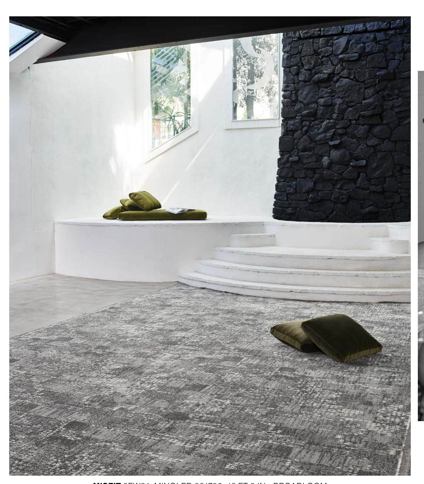
MISFIT 8FW24, MINGLED 801786, 12 FT 6 IN - BROADLOOM