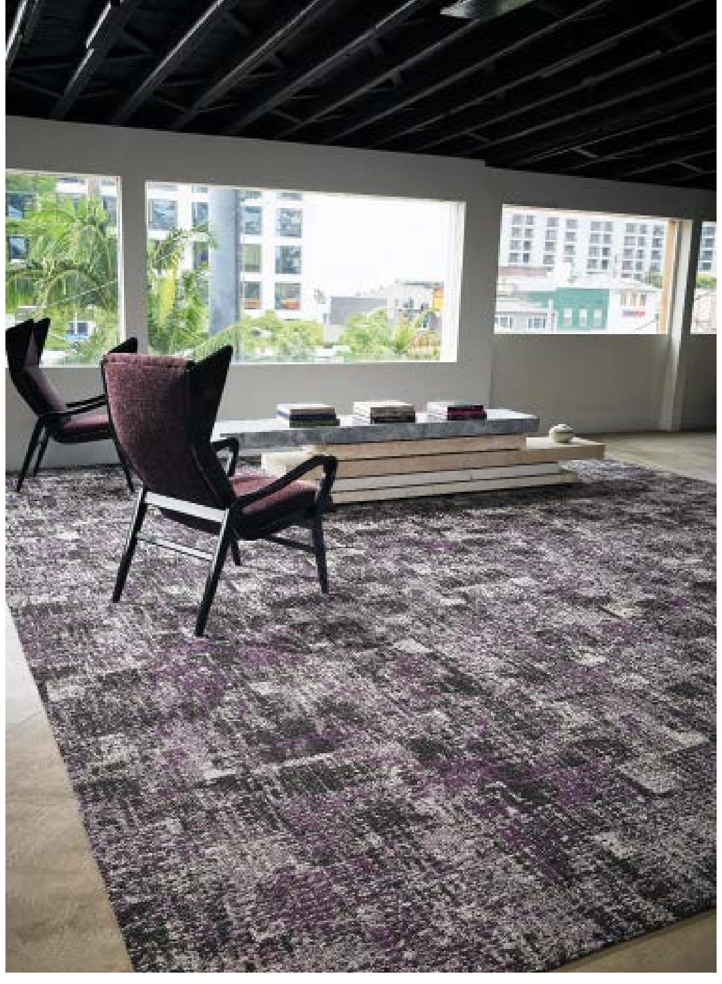
MISFIT™ 8FW24, EMBRACE 801780, 18 IN X 36 IN - MONOLITHIC