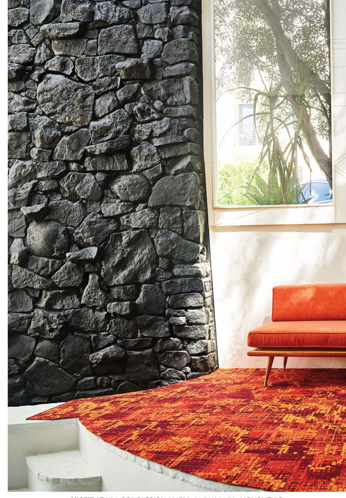
MISFIT 8FW24, COMPASSION 801785, 24 IN X 24 IN - MONOLITHIC