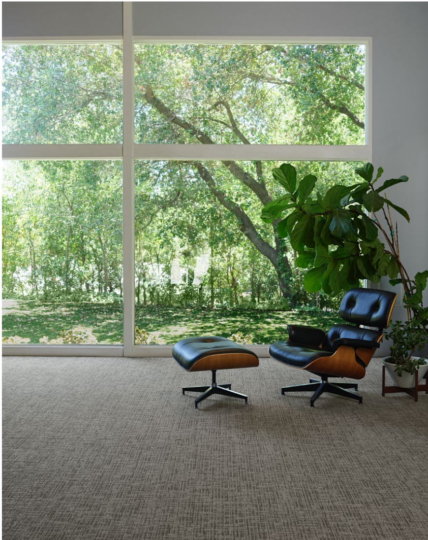
Carpet tile offered in Solution Dye (Nylon 6,6 Yarn) and Piece Dye (Nylon 6,6 Yarn)