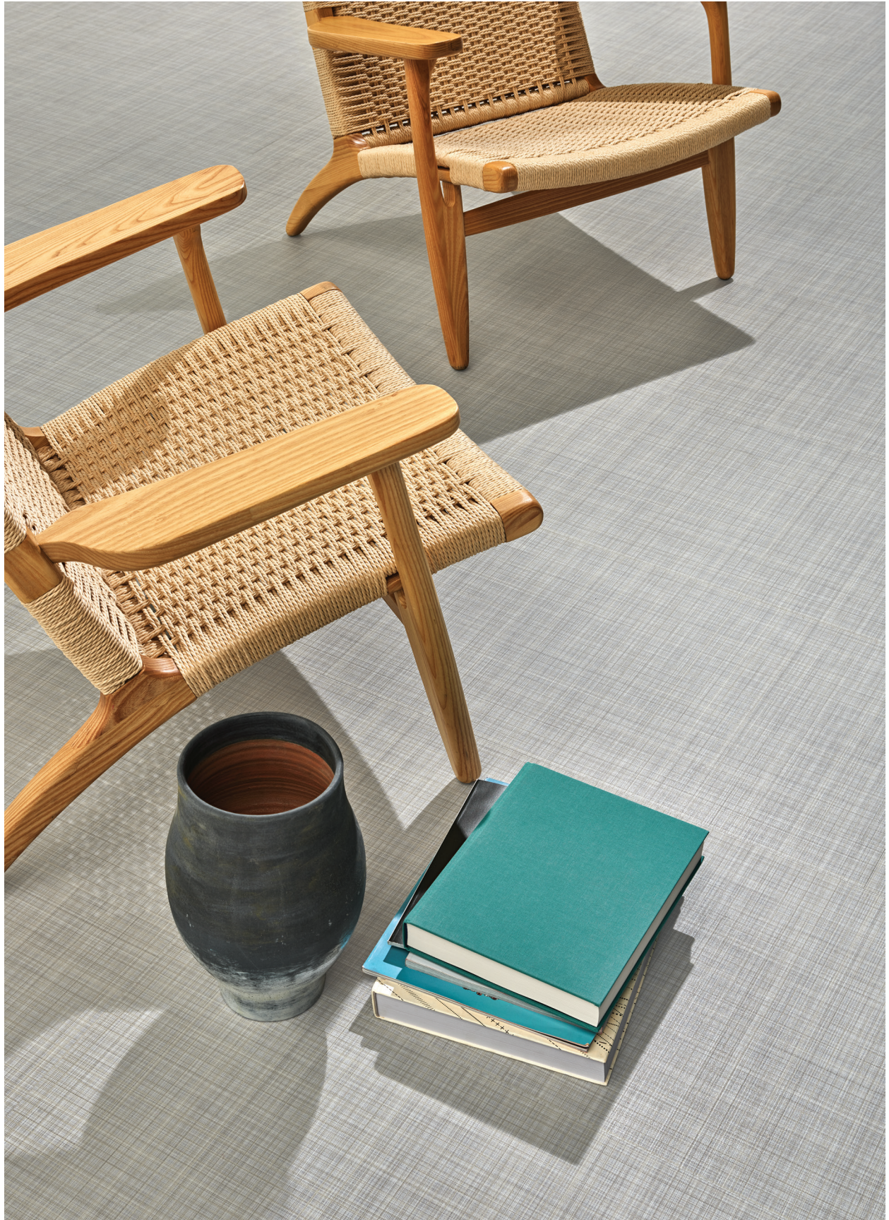
BATISTE BBAST, CAMBRIC 801840, 18 IN X 36 IN - ASHLAR