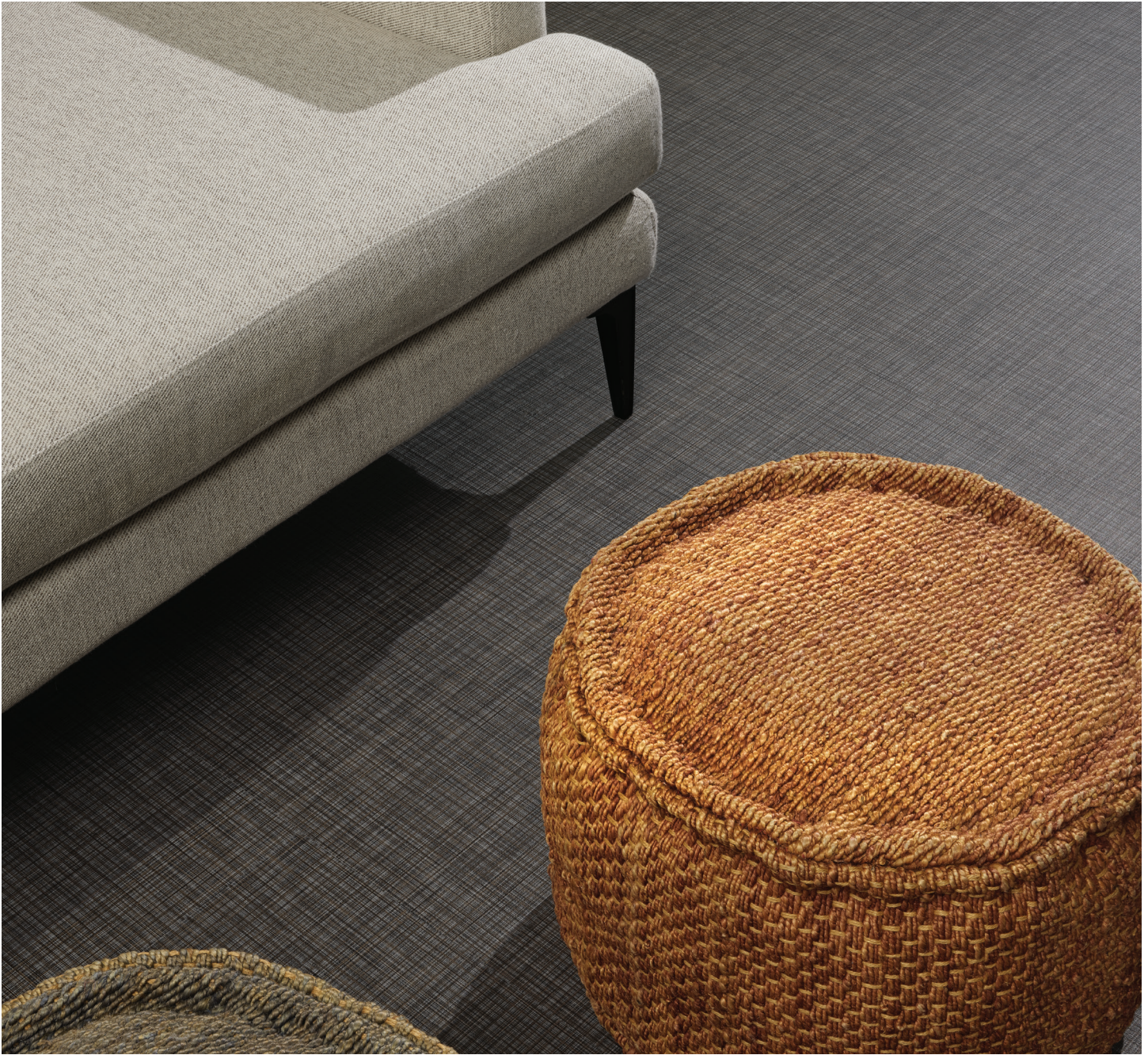
BATISTE BBAST, THREAD 801842, 18 IN X 36 IN - ASHLAR

Installation: All Bentley Luxury Vinyl Tile products must be installed by flooring installers who are professionally trained and experienced in current techniques and industry accepted standards for professional installation of luxury vinyl tile flooring. Please refer to the current issue of Bentley's Luxury Vinyl Tile (LVT) Installation Guidelines.