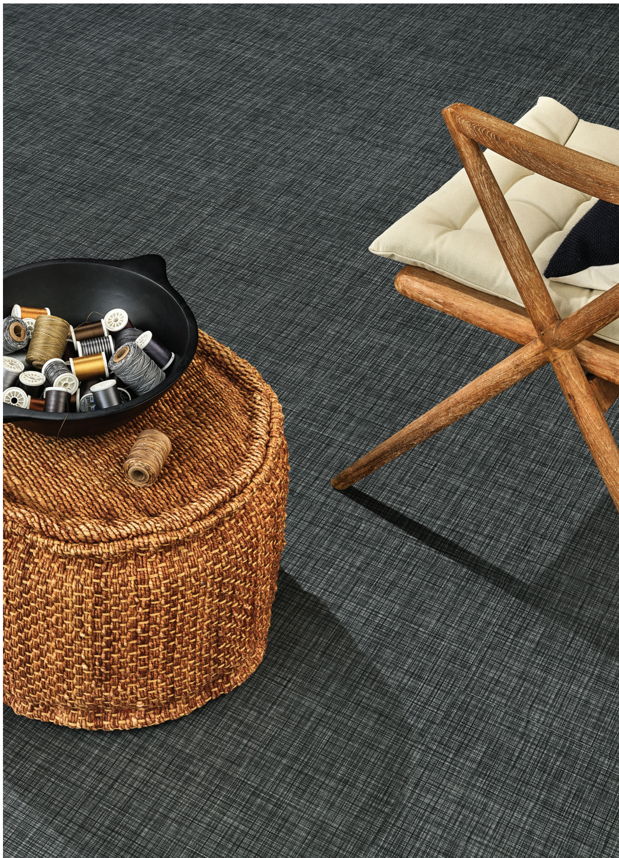
BATISTE BBAST, CHAMBRAY 801849, 18 IN X 36 IN - ASHLAR