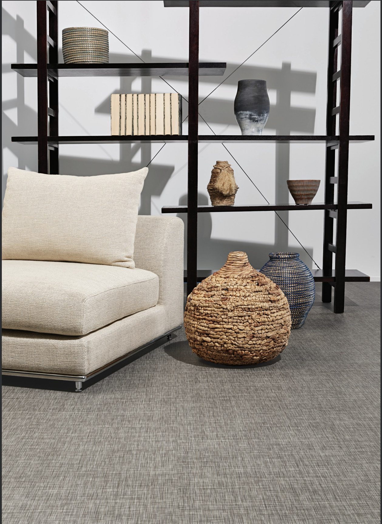
BATISTE BBAST, LINEN 801846, 18 IN X 36 IN - ASHLAR